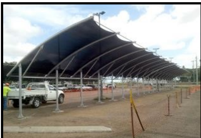
CAR PARK SHADE STRUCTURE WILMAR SUGAR — BRANDON MILL

Beehive Vinyl Products take as much care, attention and pride in our commercial shadesail projects as we do with our many domestic shadesails. We have carried out many commercial shade projects for large corporations such as BHP, QLD Nickel, Korea Zinc, Stockland Group, QBuild, Ergon Energy, Willows Shoppingtown (Dexus), Department of Defence, Spotless, Glencore, JCU as well as many local councils & schools within North & Western QLD.