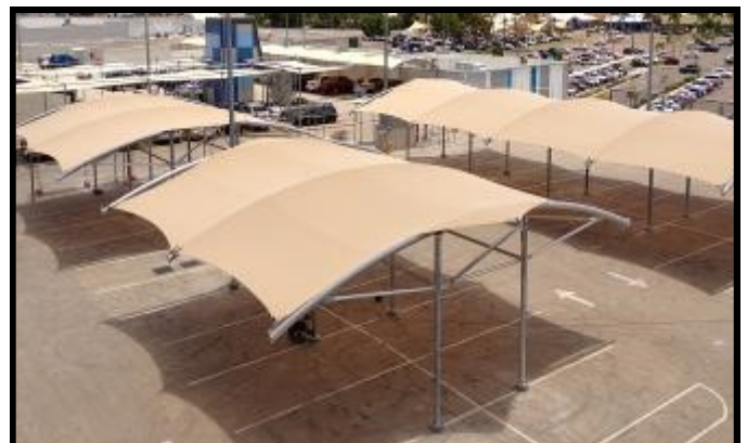
SHADE COVERS - UPPER LEVEL CARPARK WILLOWS SHOPPINGTOWN (DEXUS)