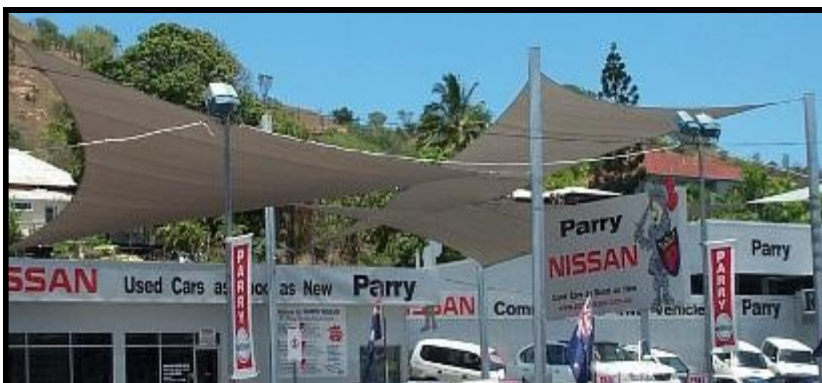
PARRY NISSAN CARYARD SHADESAILS