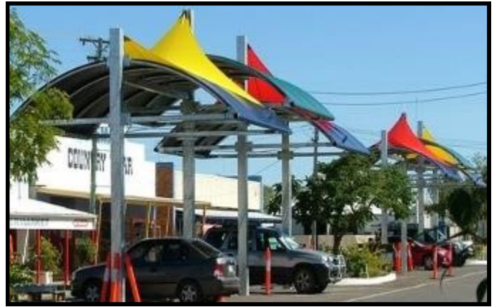
VINYL MEMBRANE & SHADECLOTH FRAME STRUCTURES FOR CARPARKS IN JULIA CREEK MAIN STREET