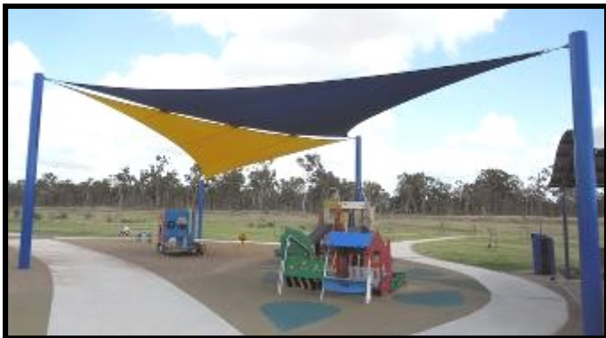
SHADESAIL AT SANCTUM BOULEVARD PARK—MAIDMENT DEVELOPMENTS