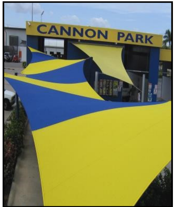
CANNON PARK CARWASH SHADESAILS