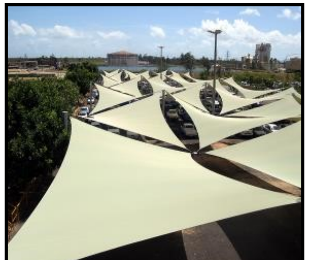
HYPER SAILS FOR QLD NICKELYABULU DAY SHIFT CARPARK