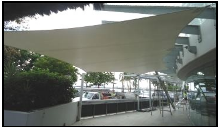
OUTDOOR EATING AREA AT WATERMARK RESTAURANT

We also manufacture & install vinyl sails and structures using specialised quality reinforced tensioned membrane material. We utilise the latest computer modelling software and computer aided plotter cutter to produce architectural vinyl membranes that achieve even tension over structures and between attachment points.