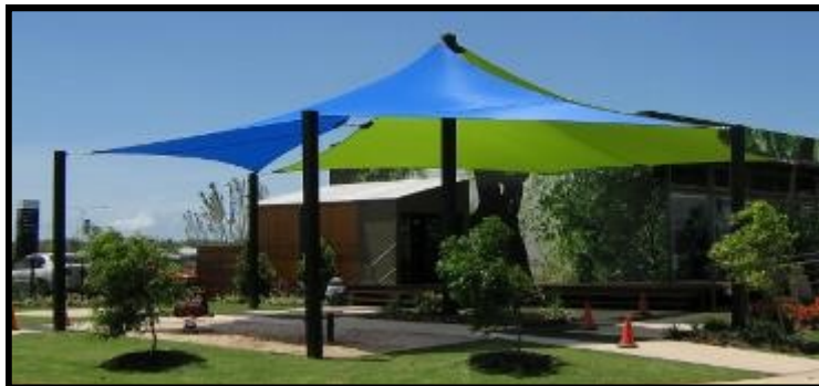
SHADESAILS AT MAIN SALES OFFICE STOCKLAND DEVELOPMENTS, NORTHSHORE