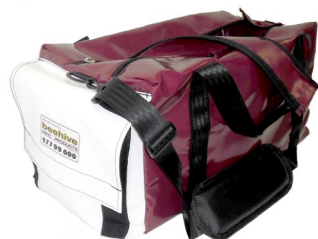
PART NO: GEARSTD-MAROON