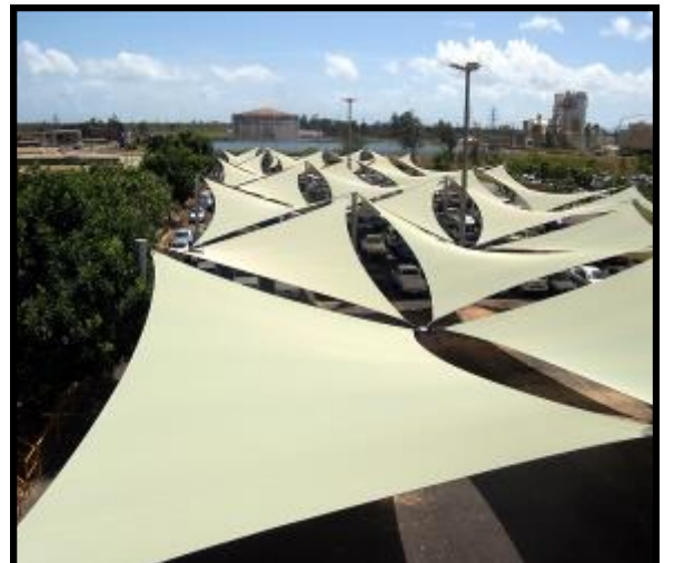
HYPER SAILS FOR QLD NICKELYABULU DAY SHIFT CARPARK