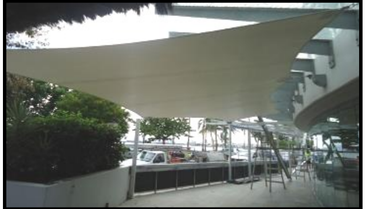
OUTDOOR EATING AREA AT WATERMARK RESTAURANT

We also manufacture & install vinyl sails and structures using specialised quality reinforced tensioned membrane material. We utilise the latest computer modelling software and computer aided plotter cutter to produce architectural vinyl membranes that achieve even tension over structures and between attachment points.