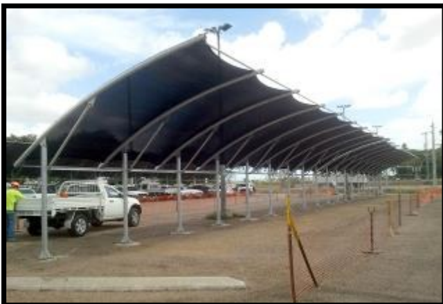
CAR PARK SHADE STRUCTURE WILMAR SUGAR — BRANDON MILL

Beehive Vinyl Products take as much care, attention and pride in our commercial shadesail projects as we do with our many domestic shadesails. We have carried out many commercial shade projects for large corporations such as BHP, QLD Nickel, Korea Zinc, Stockland Group, QBuild, Ergon Energy, Willows Shoppingtown (Dexus), Department of Defence, Spotless, Glencore, JCU as well as many local councils & schools within North & Western QLD.