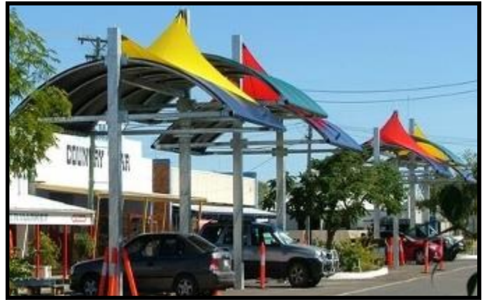
VINYL MEMBRANE & SHADECLOTH FRAME STRUCTURES FOR CARPARKS IN JULIA CREEK MAIN STREET