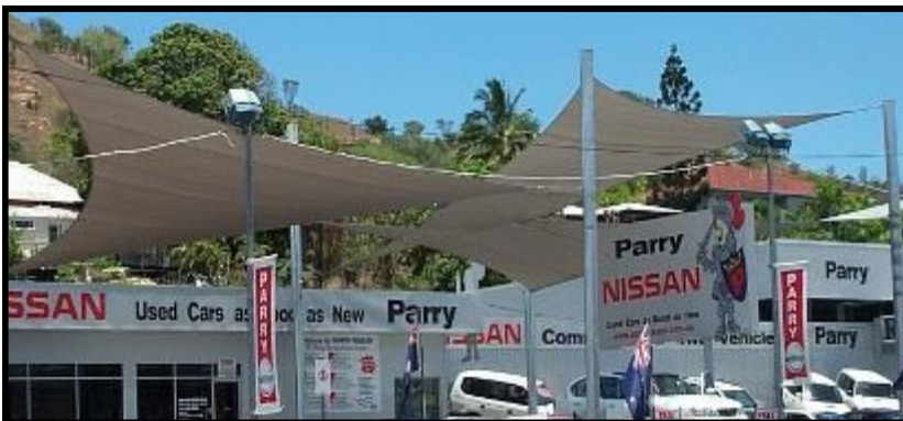
PARRY NISSAN CARYARD SHADESAILS