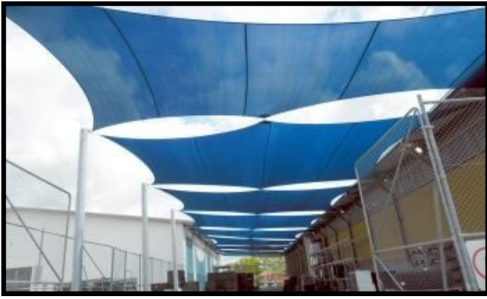
SHADESAIL ARRAY DEPARTMENT OF DEFENCE