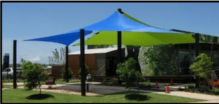
SHADESAILS AT MAIN SALES OFFICE STOCKLAND DEVELOPMENTS, NORTHSHORE